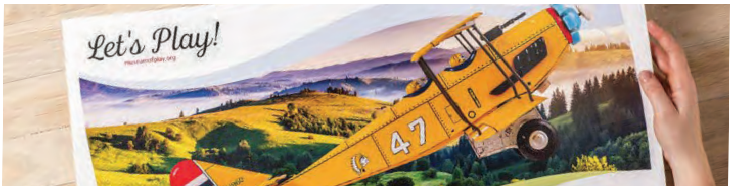
Extra-long sheet printing—maximum paper size 13 x 26" (330.2 x 660 mm)