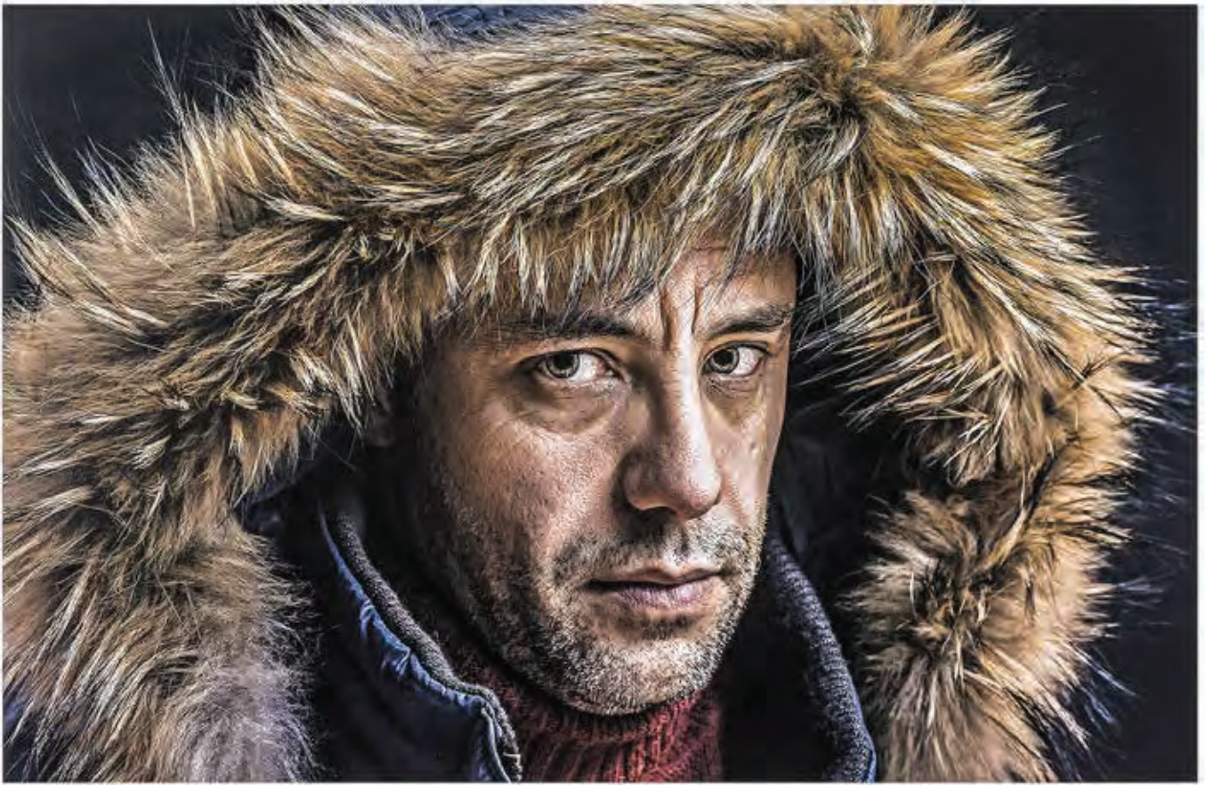
Ultra HD Resolution Technology