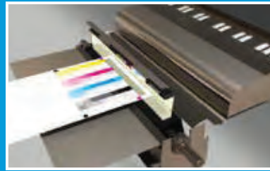
Full Width Array (FWA)

Automated Image-to-Media ensures perfect image alignment and front-to-back registration regardless of sheet size or media type—saving time and eliminating costly waste due to mis-registration or image skew.